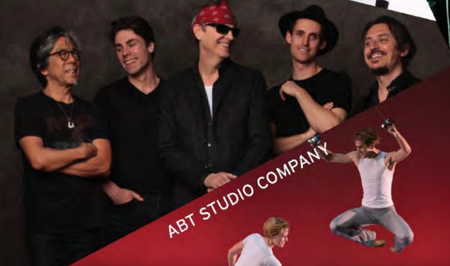
ABT STUDIO COMPANY