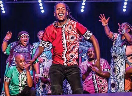
SOWETO GOSPEL CHOIR