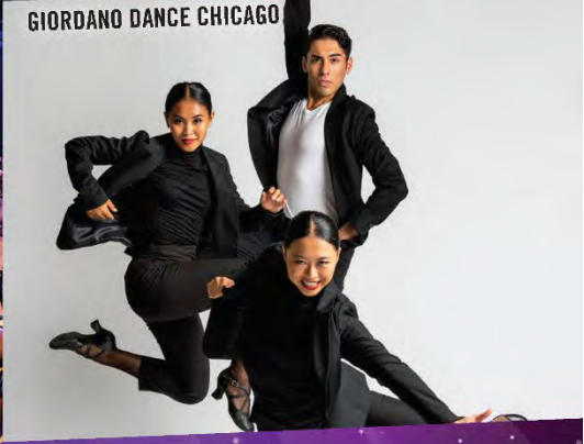
GIORDANO DANCE CHICAGO