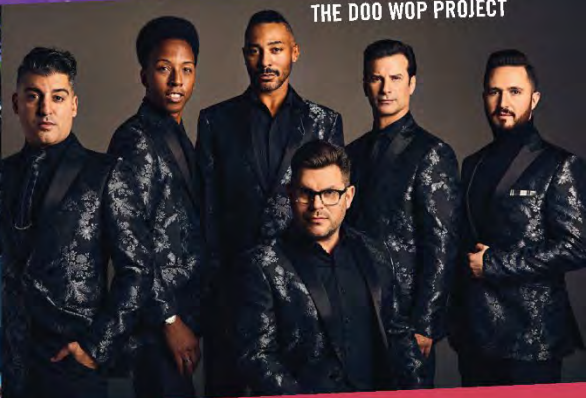
THE DOO WOP PROJECT