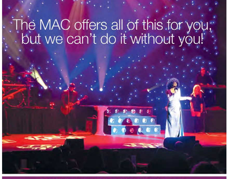
YOUR GIFT HELPS PROVIDE CULTURAL VITALITY THAT ENRICHES AND ENTERTAINS!