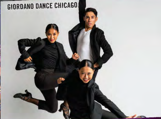
GIORDANO DANCE CHICAGO