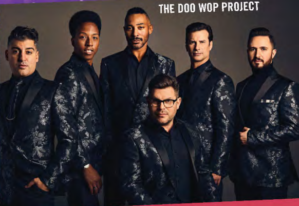
THE DOO WOP PROJECT