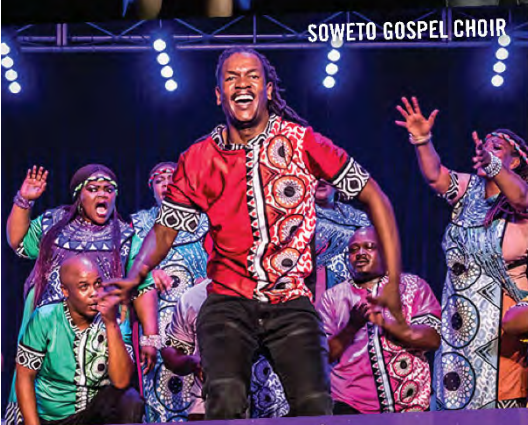
SOWETO GOSPEL CHOIR