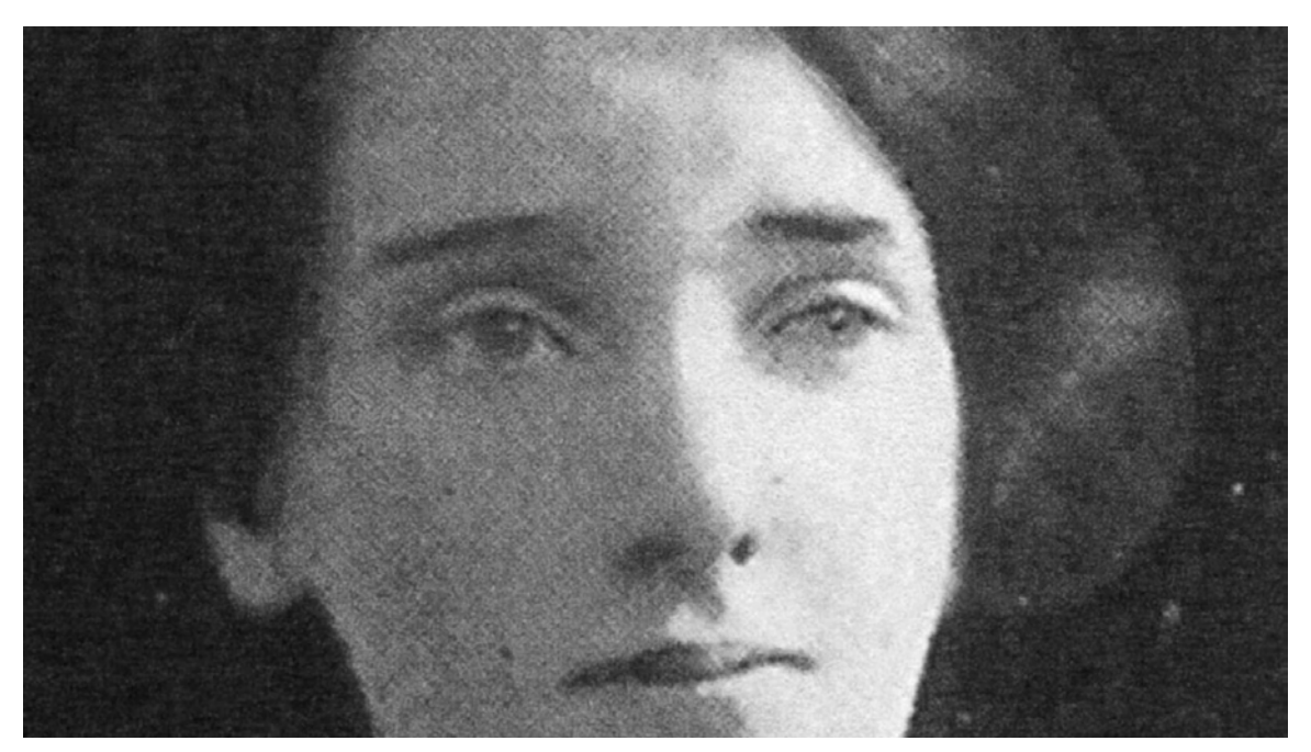
Dorothy Macardle: like many other Republican feminists, was appalled by the decision to enshrine the domestic role of women in the Constitution. So perhaps it's not surprising that, a few years later, she wrote an excellent novel that shows just how unhealthy it can be to idolize women as pure domestic goddesses

"This chiller from 1942 is decidedly old-fashioned, but the author makes it all enjoyably eerie – and throws in a few pithy social observations as well.