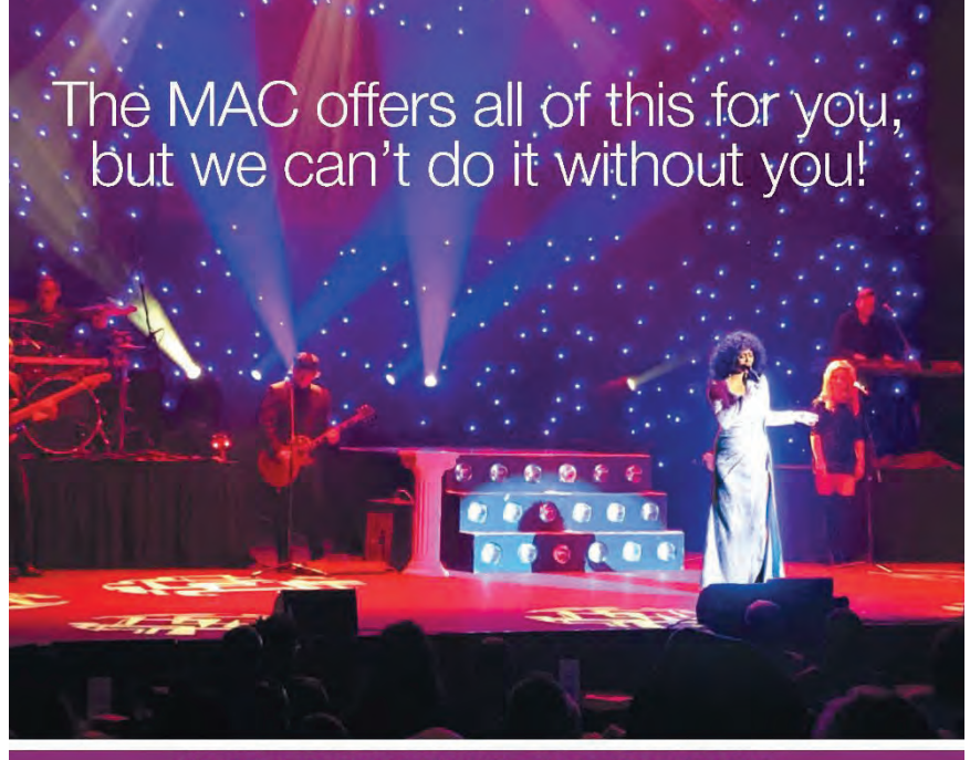
YOUR GIFT HELPS PROVIDE CULTURAL VITALITY THAT ENRICHES AND ENTERTAINS!